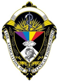
Association of Clinical Pathologists